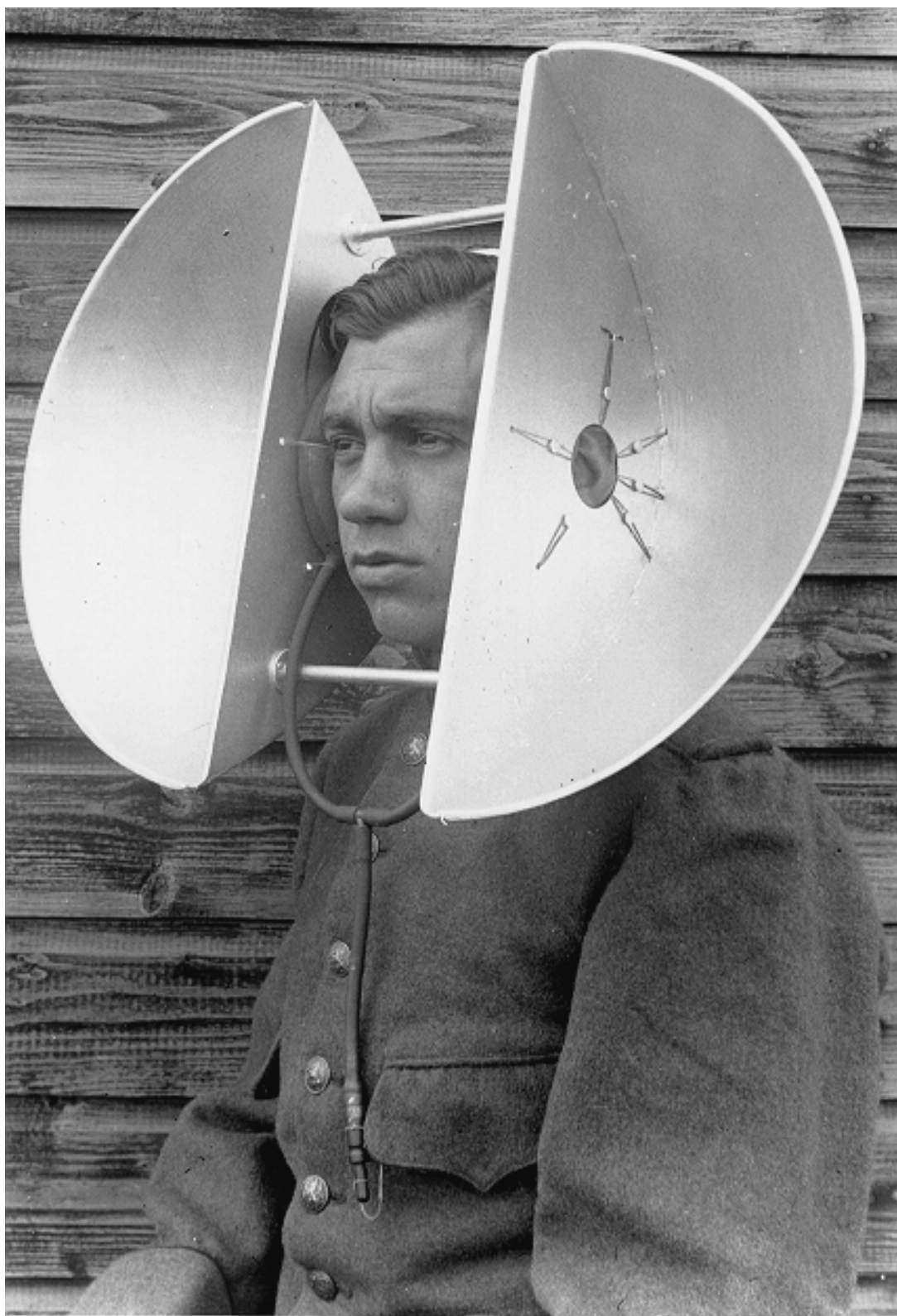
Device for locating enemy airplanes, circa 1935