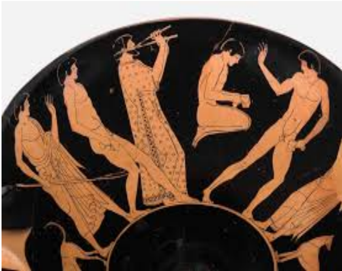
Flute player accompanies pentathletes as they train in a gymnasium, ancient Greek vase motif