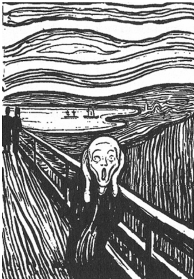
Edvard Munch: The Scream